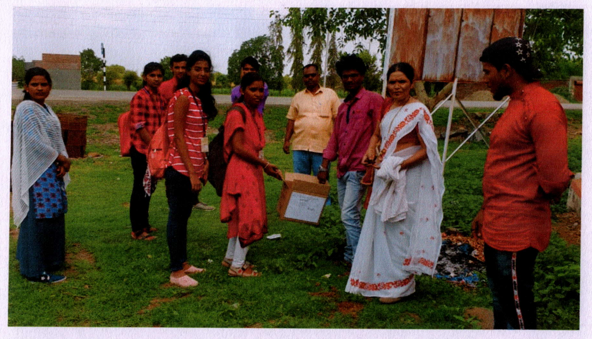
Seedball plantation by college students with the help of Botany department, near Aranwadi, Taluka Dharur 2019-20