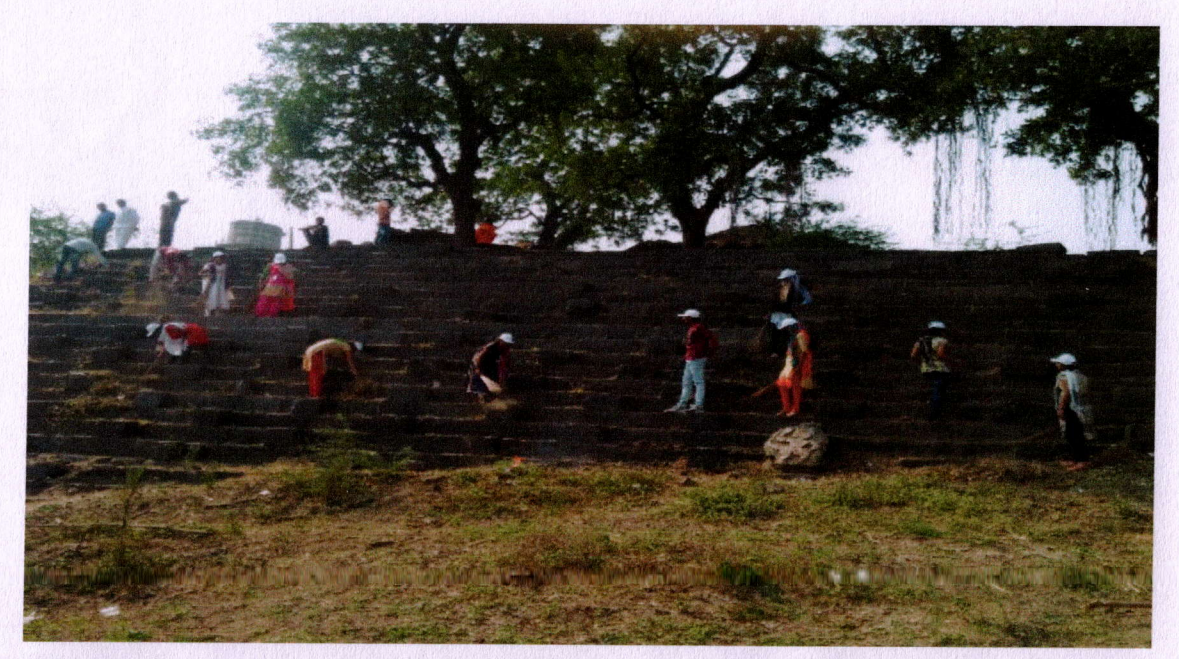
NSS volunteers of college cleaning the ghat of Godawari river in Mogra village during the NSS Shibir 2017-18.