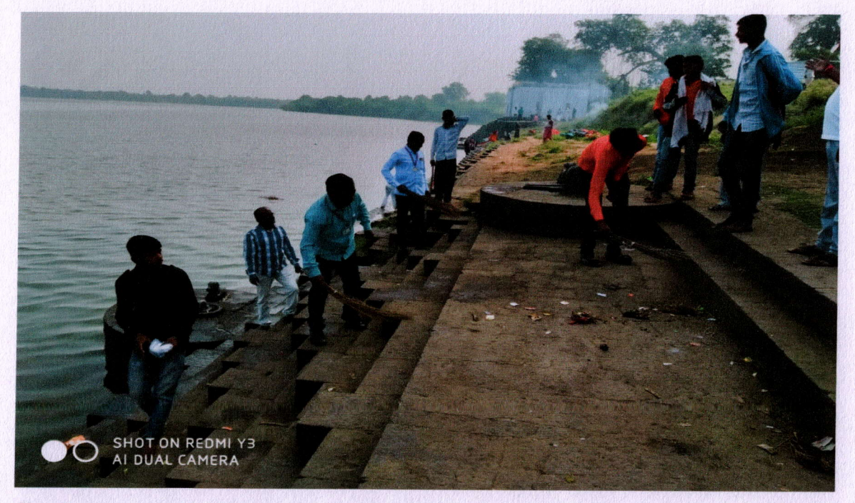
Cleanliness campaign by NSS volunteers during the NSS camp at the bank of Godavari river at Manjrath 2019-20