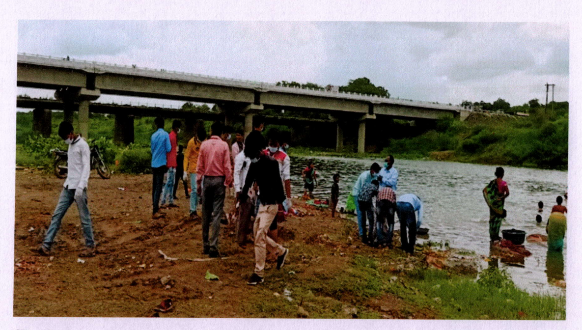
Cleanliness campaign by the college students and staff members after the Ganpati festival 2019-20.