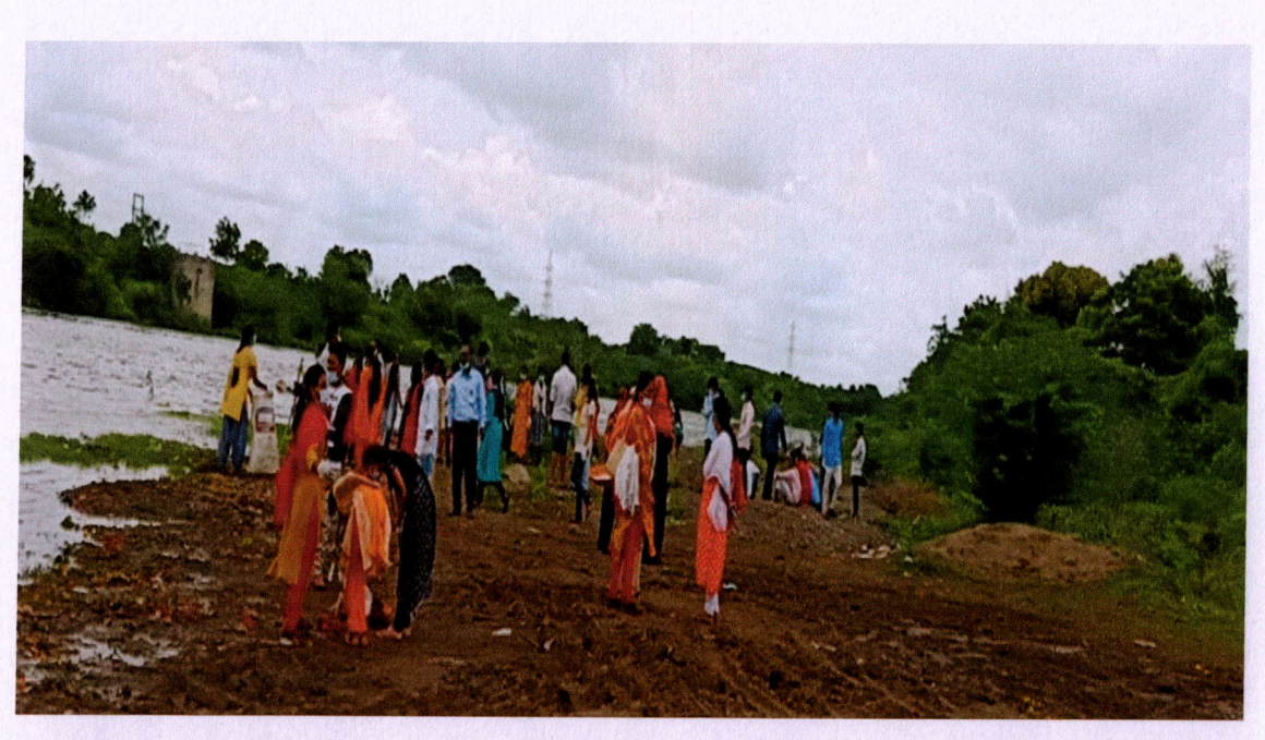
Sindhphana riverbed cleaning by college students with staff members after the Ganpati festival 2019-20.