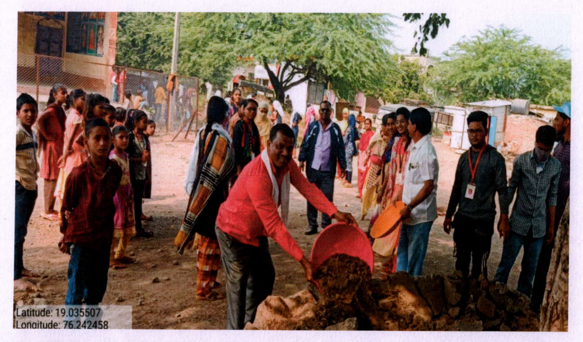
NSS volunteers and staff members of college doing the cleanliness work in Nakalgaon during the NSS camp 2019-20.