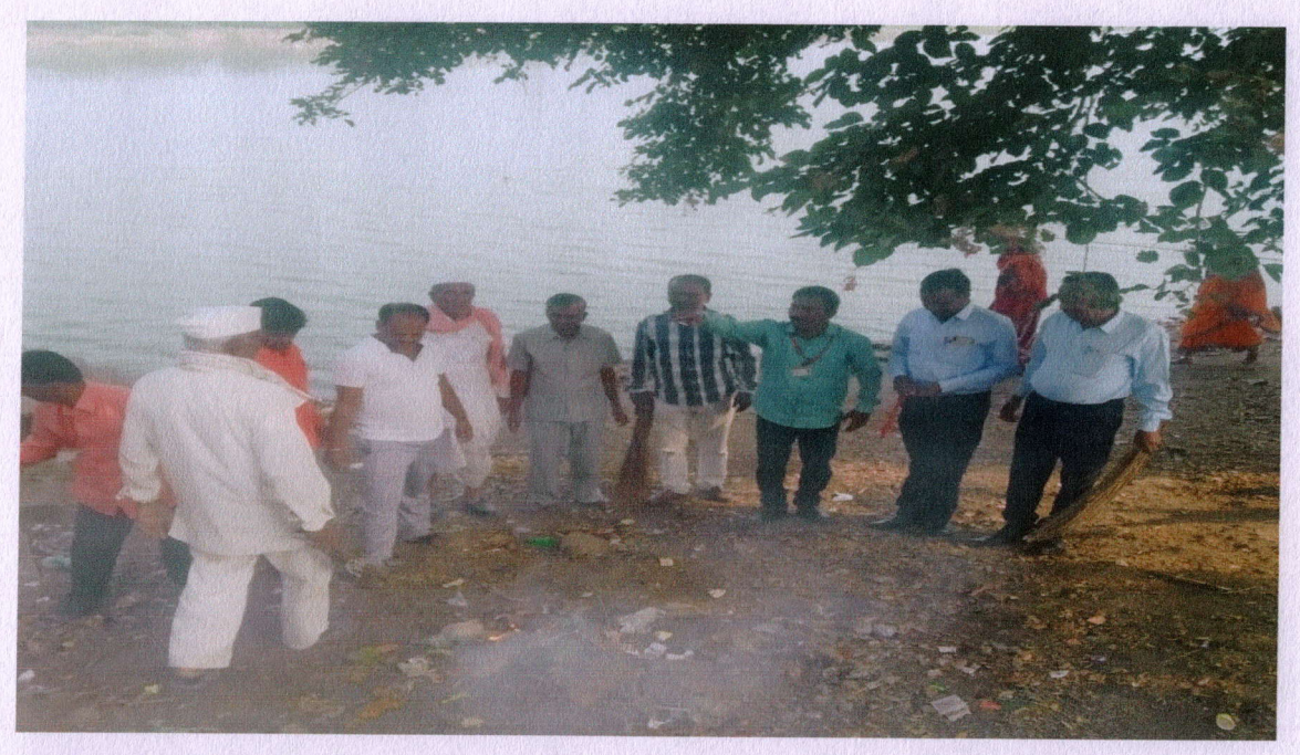
Staff members discussing with villagers for the clean and green campus of village during the NSS camp 2019-20