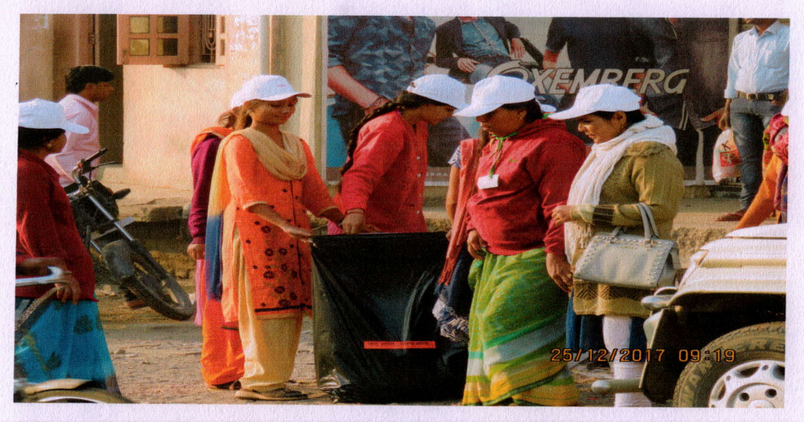
College staff with students doing cleanliness in the police station campus 2017-18.