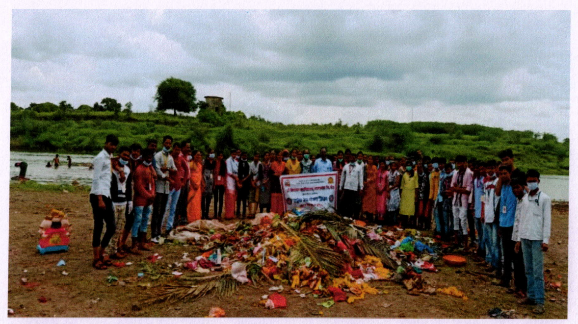
Collected garbage and waste by students of college in the Sindhphana riverbed after the Ganpati festival 2019-20.