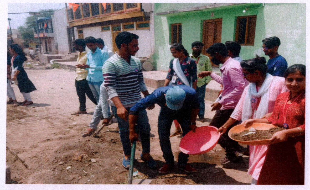
Cleanliness drive during the NSS camp in Nakalgaon 2021-22.