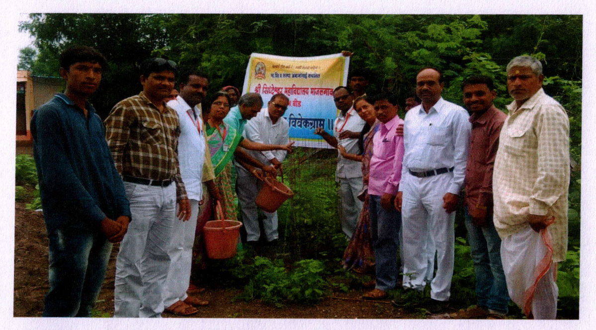
Plantation by staff members in Manjrath village was organized to stress the importance of the environment for future generations to villagers 2018-19.